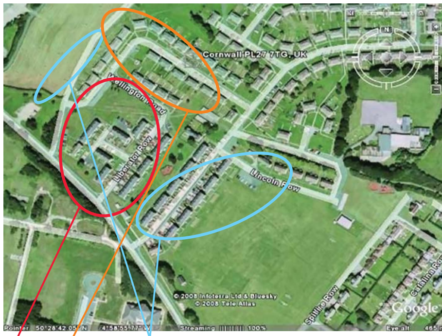
Figure 5. GIS view of the location of St Eval and Bears Down Windfarm