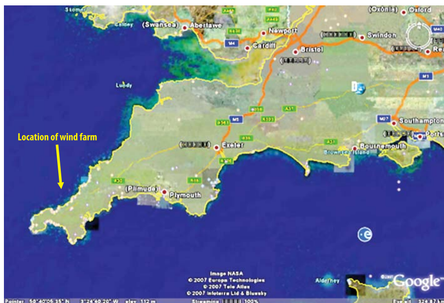
Figure 4. Location of Bears Down wind farm in North Cornwall

Whilst individual houses within the two sub-sets were very similar, a physical inspection of each house in our data set was not possible which meant that factors, such as a loft conversion, which would have affected selling-price were not included.