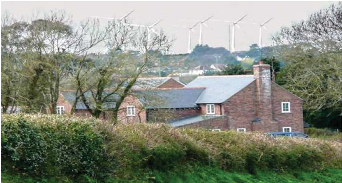
Figure 1. View of a wind farm from Nutcrack Lane, Dorset, UK

Previous research in the UK has generally focussed on public and professional opinions towards proposed wind farm developments or the perceived impact of an existing wind farm on house prices (Impact Assessment Unit, 2003). There has only been one previous study to attempt to quantify the real impact on value and that proved inconclusive due to a lack of available data (Sims and Dent, 2007). Therefore, further research to establish their impact on house values and amenity would be of benefit to property professionals and the wind generation industry.